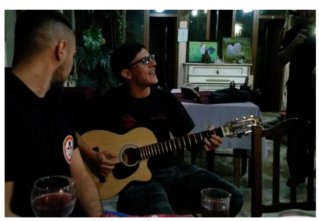
Mariachi from Argentina